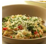
Creamy Mock Risotto